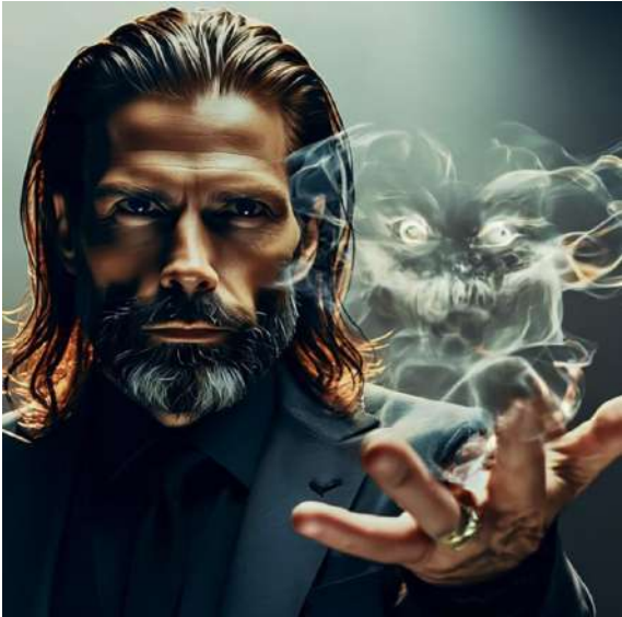
Gerrat Tensh has the power to mesmerise the weak-minded