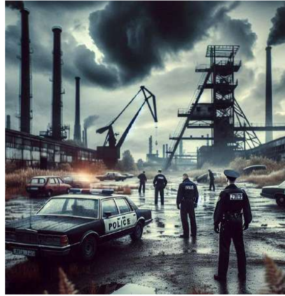
Crime scene where Lucia is found