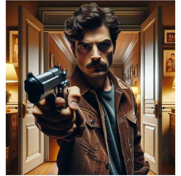
Logan hunts the serial killer